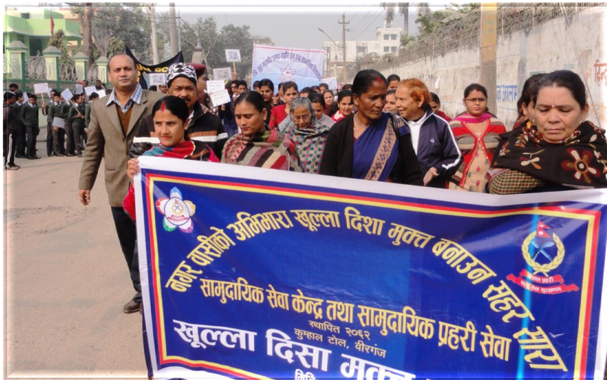
Rally from School student and Community people joined their hands for ODF announcement

Birgunj SMC heartily welcomes and requests all stakeholders to have their moral and logistic supports, together joint their hands to achieve this motto of all wards ODF announcement.