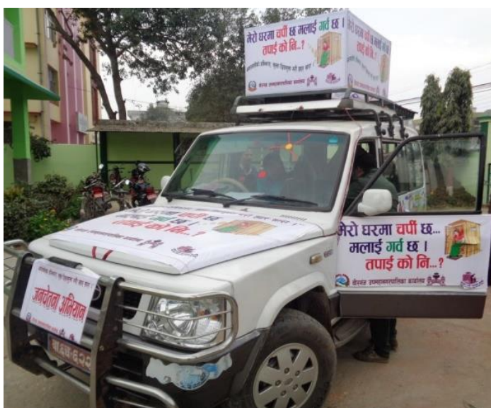
Mobile vehicles intensively moved for ODF mass campaign throughout the Birgunj Sub-Metropolitan City areas.